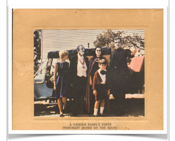
"The Munsters" visit Pinecrest Dunes, Southold.