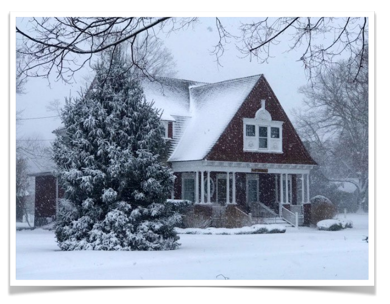
Pictured Left: Horton Point Lighthouse shines brightly through the snowy sky. Pictured Above: A blanket of snow surrounds the Ann Currie-Bell house at the Museum Complex.